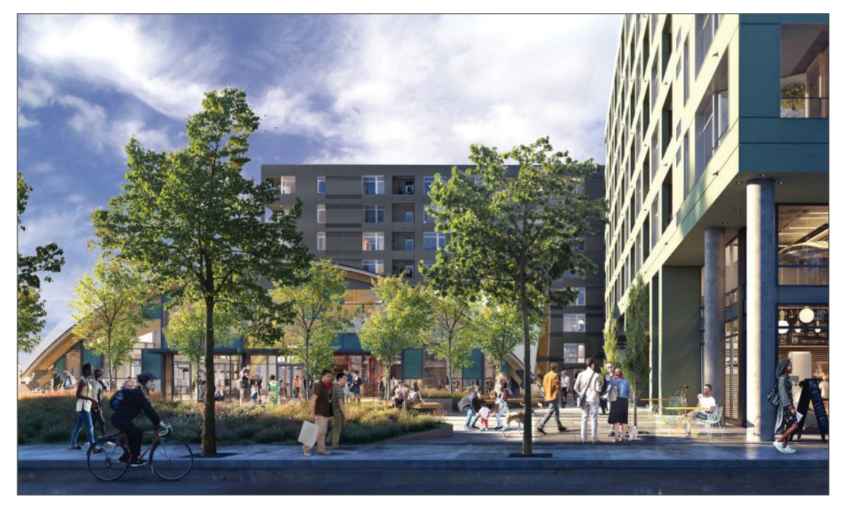
Mithun's Splash Apartments in Portland, Ore., include a plaza area with custom-designed benches and a water feature that is available to residents as well as to the public.

Similarly, developers of affordable housing are adding designated space for telemedicine