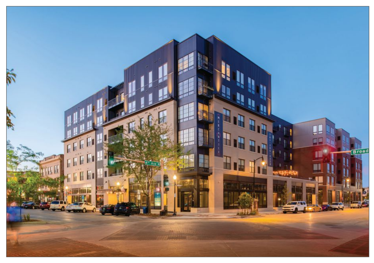
JLG Architects completed Mercantile in Fargo, N.D., earlier this year. The property was built on the site of a former 1909 brick warehouse that was demolished in the 1960s.

"Typically, once you get away from specific regional variations, multifamily design changes are fairly incremental — you usually don't see seismic moves," he adds. "I wouldn't say that the pandemic has had a tremendous impact, but it has had a more measurable impact than we tend to see to the point where you can see change from project to project."