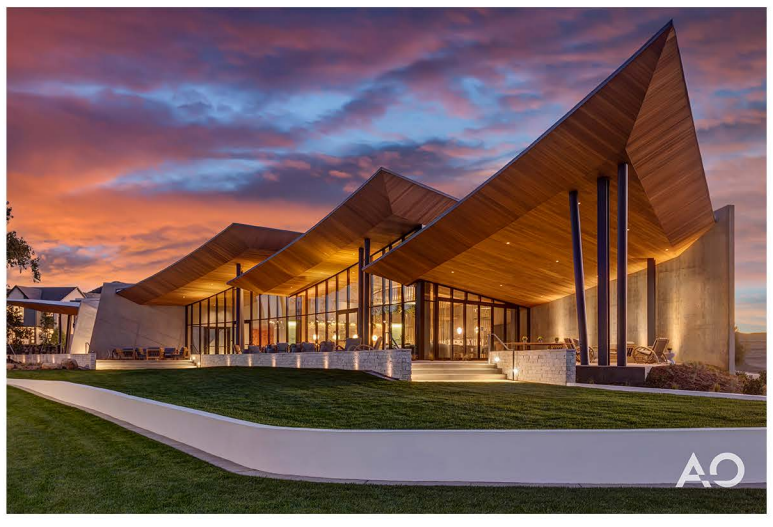
Confluence Park at FivePoint Valencia by FivePoint Valencia Communities