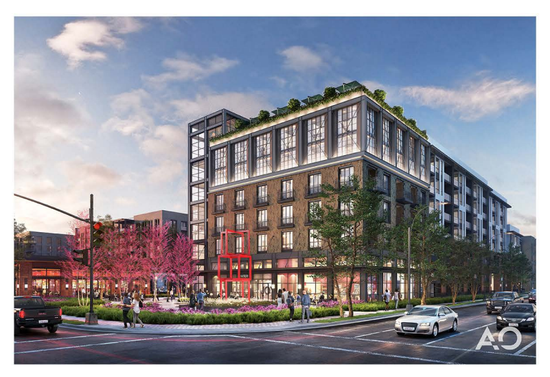
Warner Red Hill by Greystar