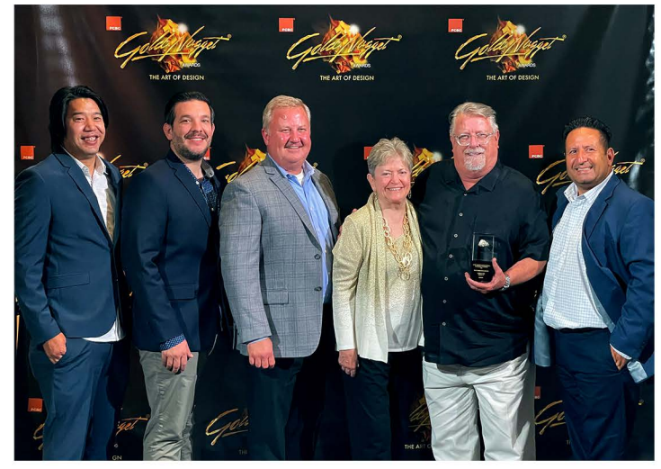
Grand Award Winner Best Community Amenity Best Design for Energy