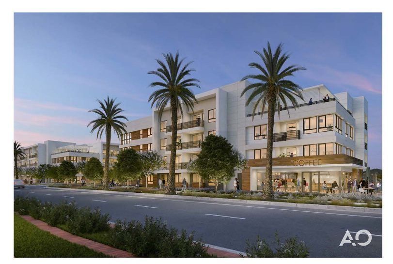
Iowa Apartments by UDR & Seritage