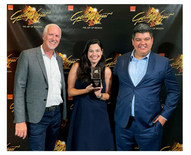
Grand Award Winner Best On-the Boards Mixed-Use Project