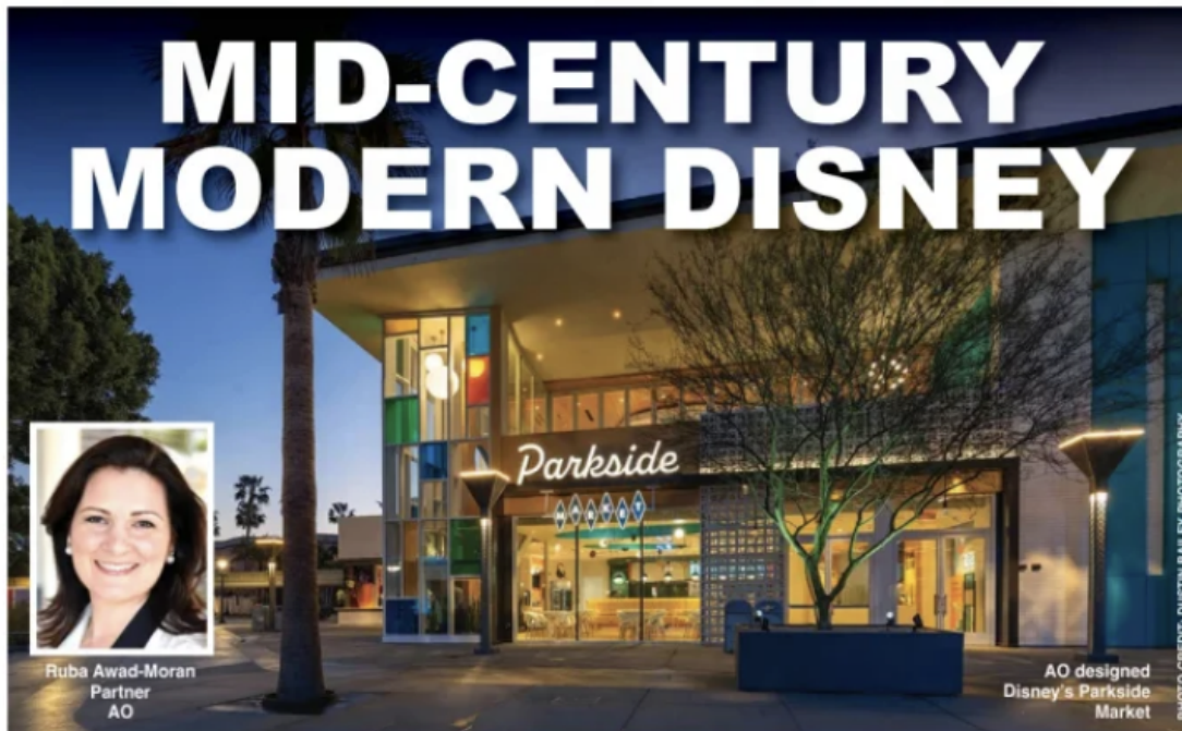
AO designed Disney's Parkside Market