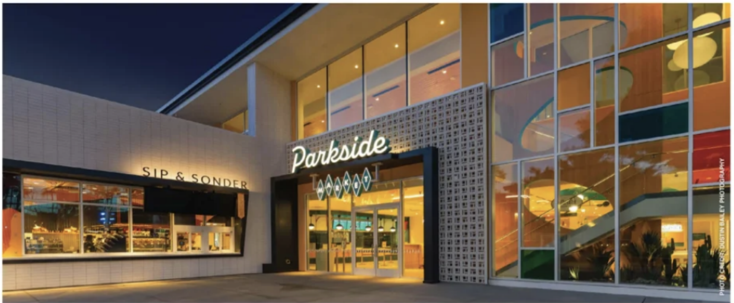
The AO-designed Sip and Sonder sits astride Downtown Disney's first food hall, Parkside Market