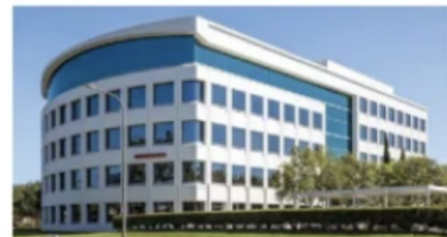
Newport Plaza, a five-floor office building at 895 Dove St. in Newport Beach, is under new ownership