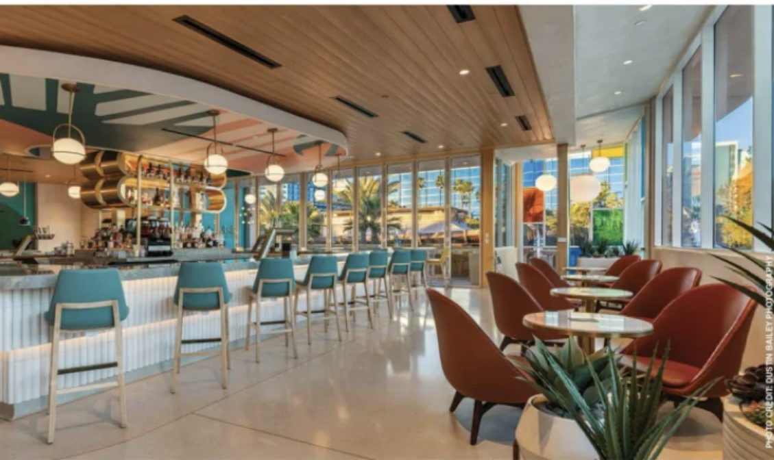
The Vista Parkside Market's bar has a mid-century modern look